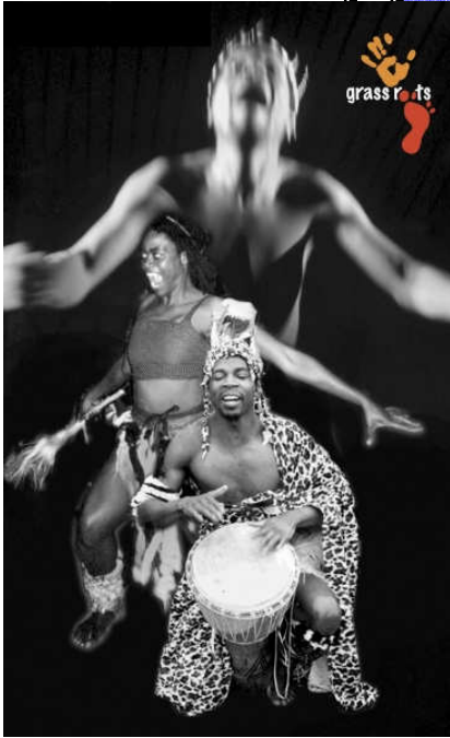
'Grassroots' bring their music and dance to our school this Friday.